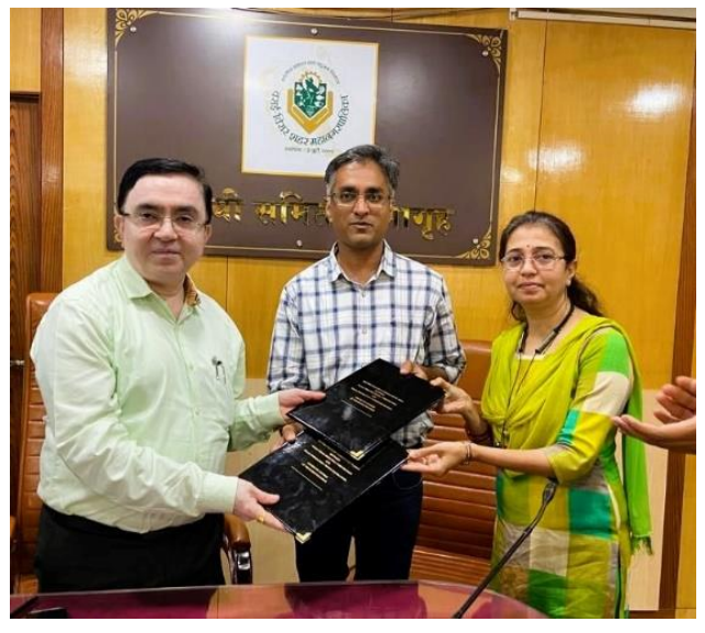
MoU with Vasai-Virar City Municipal Corporation [in collaboration with Woman in Need Given Support Foundation (WINGS)]